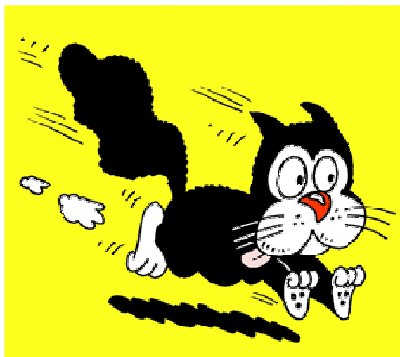
Get hungry for God!

May the words of Psalm 19:7-14 motivate and spur us on to be committed to not just read the Word but to study the Word as well. You too "busy"? The correct question should be, "You hungry?"